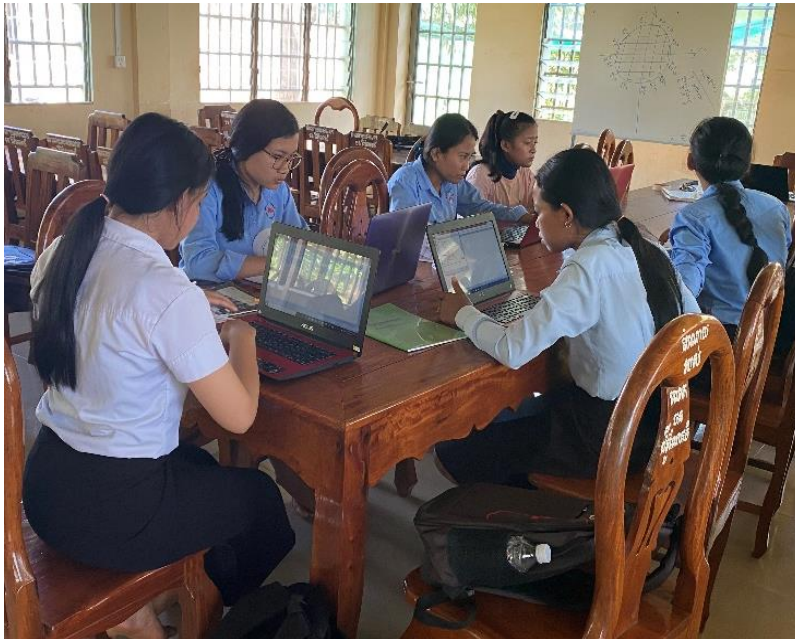
12 th Graders' Computer training when allowed

JGG relies on the schools to be open and students to be coming to school in order to operate its English language program. With the schools closed it had no choice but to suspend the program in April. The program opened slightly in September/October as students returned to school, but in December the program again closed.