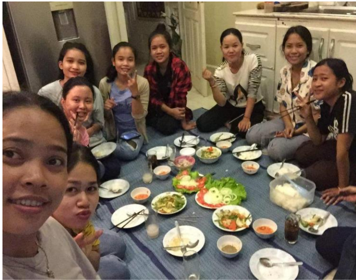
Food Support for Alumni by Charleys Kids foundation helped ease their difficulties during Covid-19

Student Teacher Alumni (former Student Teachers) who were in university and staying at JGG's dormitories in Phnom Penh and Siem Reap also shifted to online learning. Adding to their difficulties was the cut back by employers due to the economic slowdown. Most of JGG's Alumni either lost their jobs or had hours and salaries severely cut. The most affected were those Alumni in the Siem Reap dormitory, since Siem Reap is the tourist center of Cambodia. Generally, Alumni work full-time while at university to help pay their study costs and support their parents and siblings still in