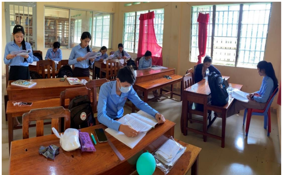
Student Teachers' English Training was in person when allowed

As in earlier quarters, during the 4th quarter JGG continued training Student Teachers adjusting its schedule and methods to comply with changing governmental restrictions.