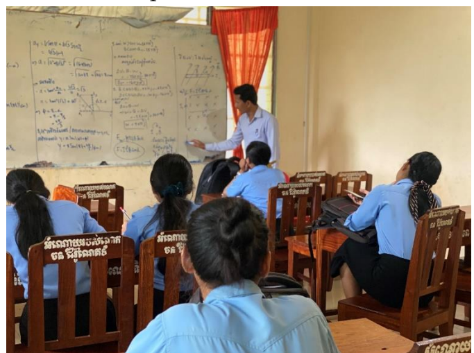
12 th Grade Student Teachers were trained by Professional Teachers in person when allowed

3. When the Learning Centers were available, Student Teachers in the 12th grade were taught by professional teachers provided by JGG in the areas of chemistry, biology, physics, mathematics, and English in preparation for the eventually cancelled 12th grade exam. These students were also given instruction in the preparation of CV's (resumes) and how to interview for a job. Finally, they were instructed on how to choose a university major, and other aspects of starting their college career. Unfortunately, visits to universities were not possible.