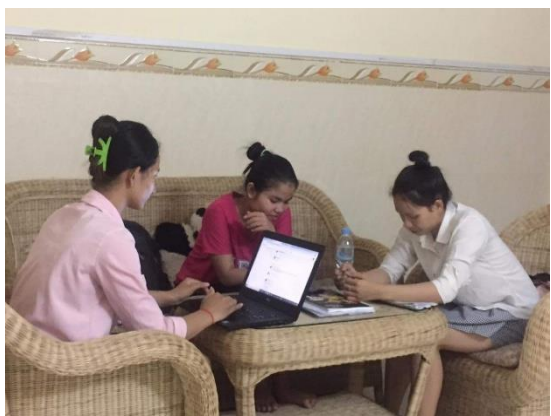
SVAs at the Phnom Penh dormitory

Most universities in Phnom Penh and Siem Reap have moved their courses online. Former JGG Student Teachers attending these universities remain in JGG's dormitories. Most former Students Teachers attending a university with no online teaching have returned to their home.