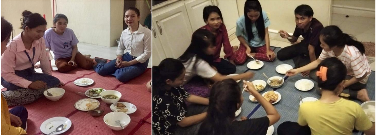
JGG's Student Teacher Alumni at Phnom Penh and Siem Reap

Since 2019 Charleys Kids Foundation (CKF) has been an important supporter of JGG focused on helping JGG Student Teachers transition from high school to university. CKF's funding has been particularly vital during the pandemic. It has allowed JGG to provide food and other basic needs to our dormitory students. As a result of CKF's support, the former Student Teachers at our dormitories will remain on a track leading to achieving a university degree.