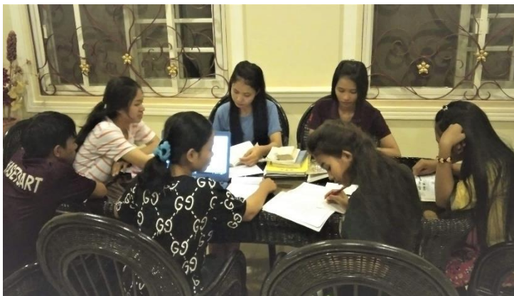
SVAs at the Siem Reap dormitory

JGG allows all 12 th graders to use the JGG Learning Center Library and its superior internet.