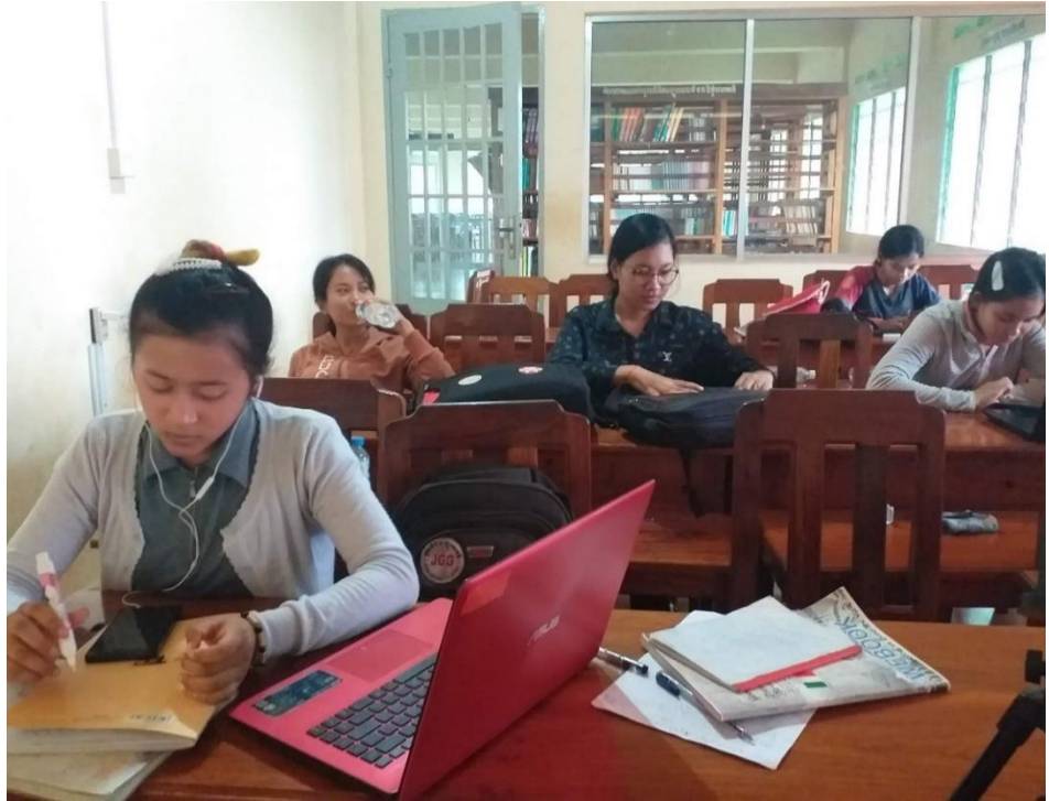
JGG's 12 th Graders learning in the library during COVID-19

In mid-April, the Ministry of Education enhanced its online program by having state teachers teach the online educational programs to the 12 th grade only. So, 12 th grade Student Teachers are now being trained online by state teachers. JGG monitors the progress of the 12 th grade Student Teachers to ensure the quality of their learning and continues to train the 10 th and 11 th grade Student Teachers.