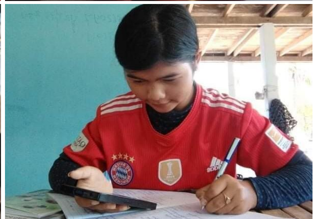
JGG's Student Teachers learning at home during school closures due to COVID-19