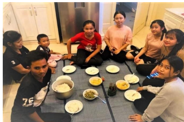
SVAs in Siem Reap sharing a meal

Since 2019 Charleys Kids Foundation (CKF) has been an important supporter of JGG focusing on helping JGG Student Teachers transition from high schools to universities. CKF's funding has been particularly vital during the Covid outbreak. It has allowed JGG to provide food, dormitory room, utilities and other basic needs to our dormitory students. Many of them have lost jobs or are underemployed due to the crisis.