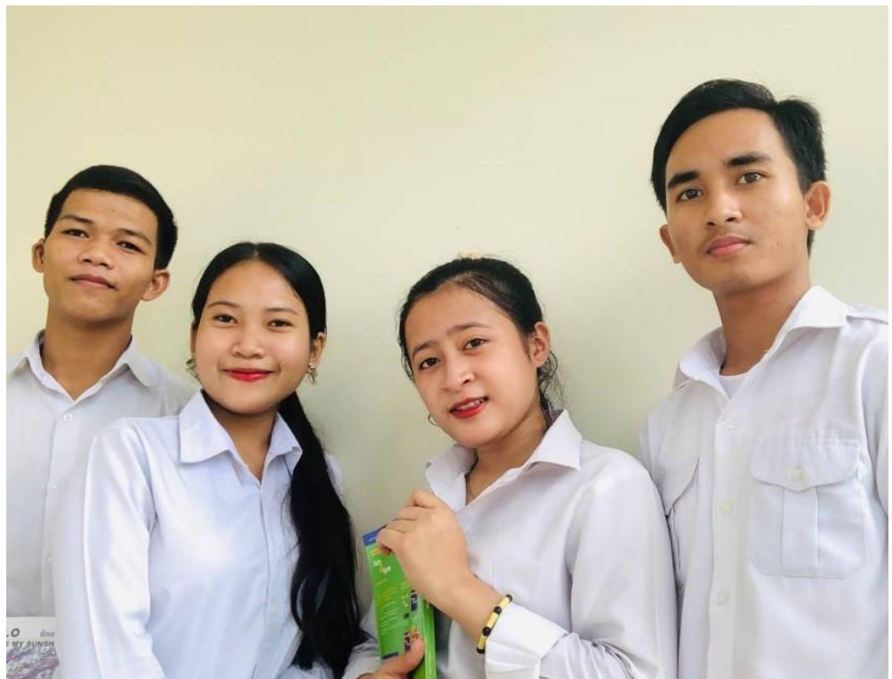
The Four students passed the exam and awarded fully paid scholarships by medical group in Japan

Under this program, which is sponsored by a medical group in Japan, the training includes three years of study in Cambodia, followed by two years of study in Japan. After that, the then certified nurses will work in Japan for an extended period. All four of these students were awarded fully paid scholarships.