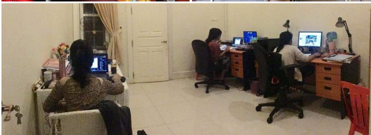
SVAs in Phnom Penh & Siem Reap Dormitories are learning online