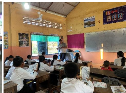
Class inspection by Director