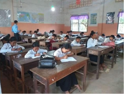
English Outreach Program Test