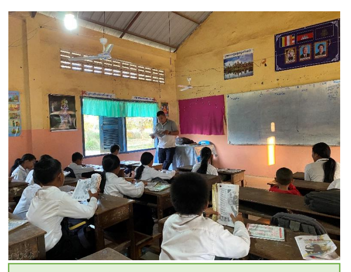
Class Inspection - JGG BCC

The JGG Director and all Program Assistants and the librarian conducted regular inspections of the classes taught by Student Teachers (5PM to 6PM weekdays) to check the performance of the Student Teachers to make sure they have good pronunciation, speak clearly, have good penmanship, good lesson delivery (reflecting good preparation) and show encouragement toward their Also, they need to have a students. positive attitude, and dress neatly. The students are interviewed to make sure they are successfully attaining reading, writing, and speaking proficiency.