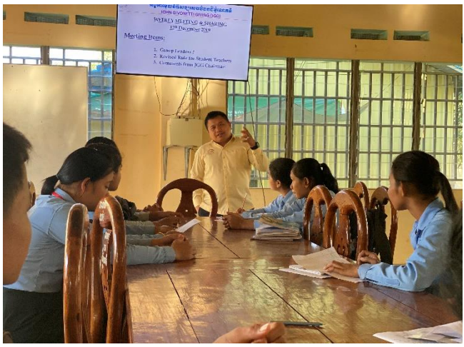
Computer Skill Training at the weekend & Student Teachers' Weekly Meeting