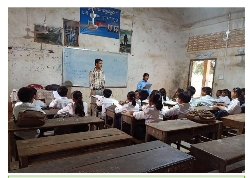
Students teaching students - Program at Romlech

JGG's student population was 343 students at the end of the reporting period. This represents a decline of 17 students from last quarter's 360. The primary reasons for the decline was poor performance, and/or poor attendance.