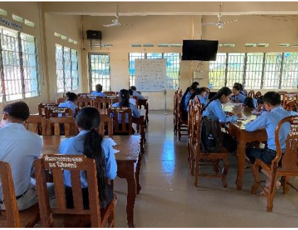
Basic English and Grammar Training